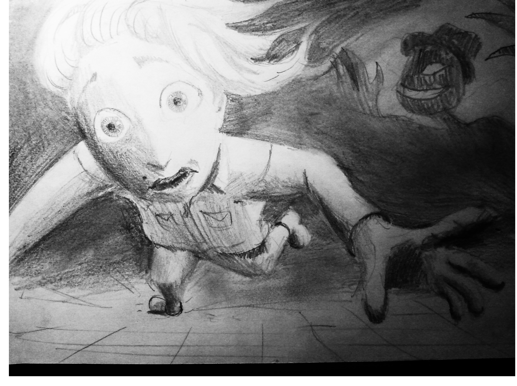
Hopeless Girl runs and falls As scared as she is, she missteps and falls to the ground, suddenly there is a strange voice coming from the background...