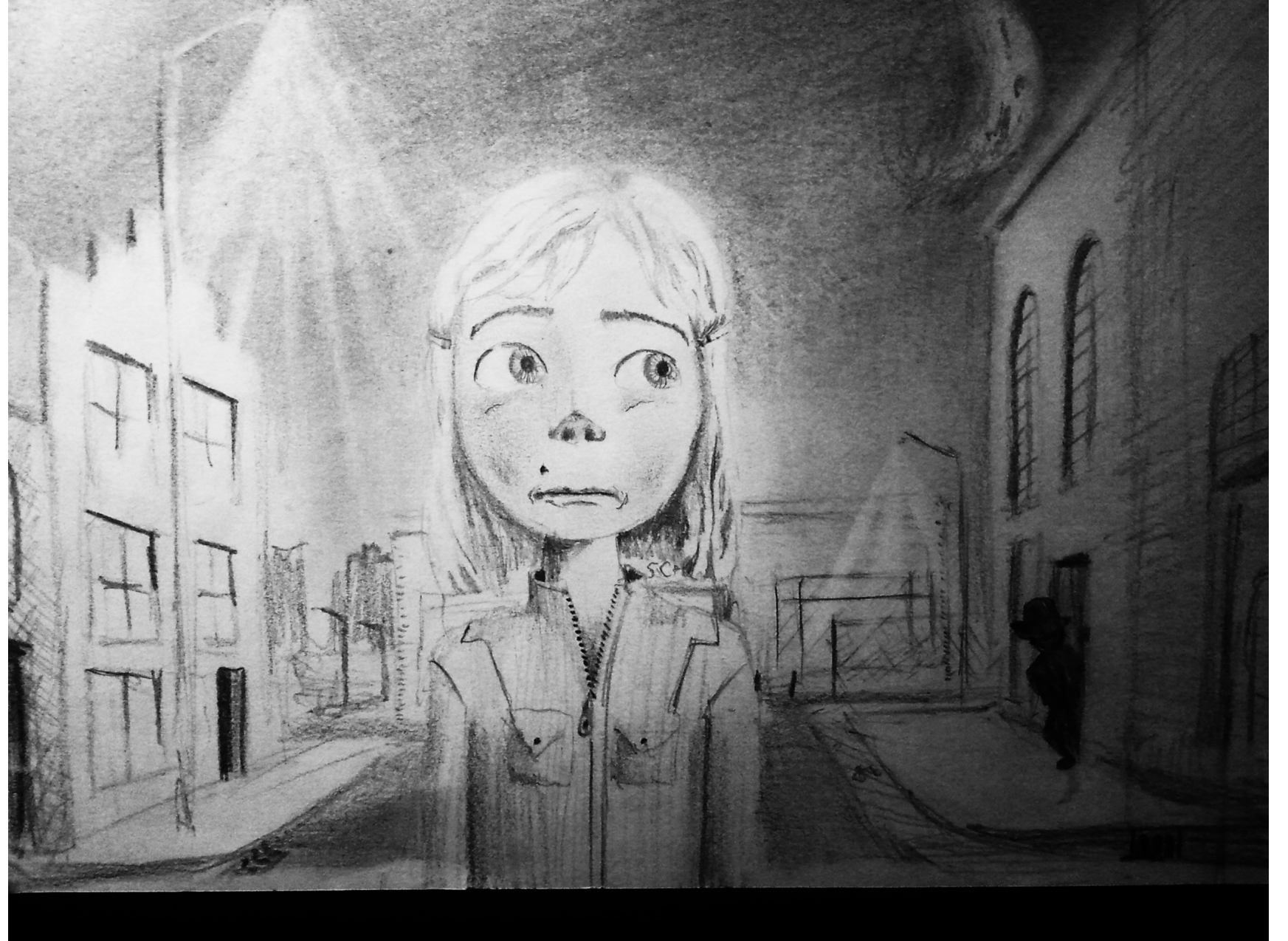
Hopeless Girl being followed She notices several strange sounds, footsteps and starts walkking faster, she's very scared.