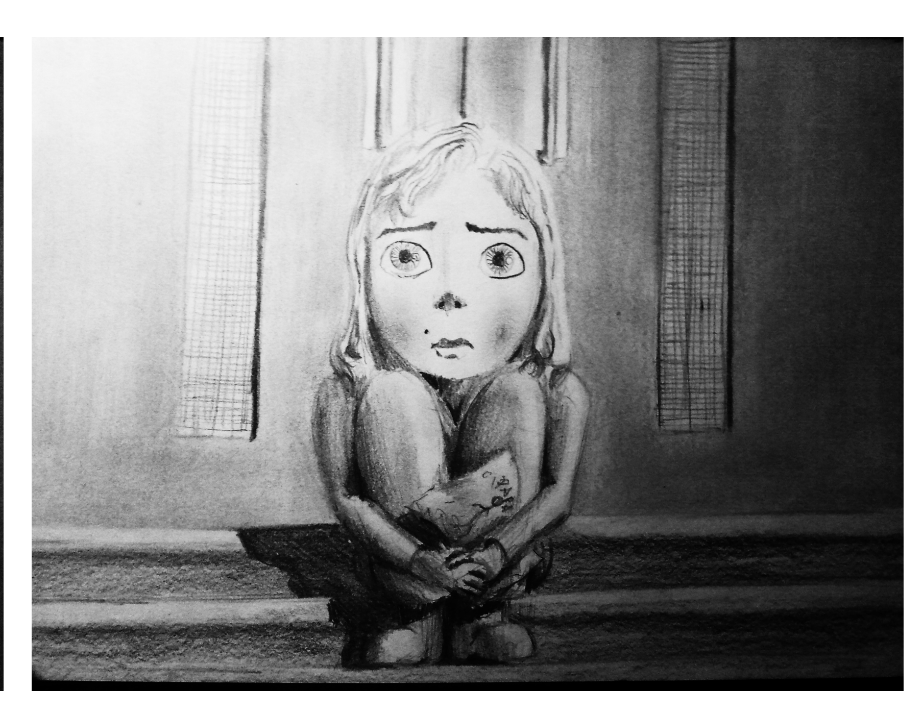
Hopeless Girl being hopeless Girl is confused, starts crying a little bit, still holding on to her