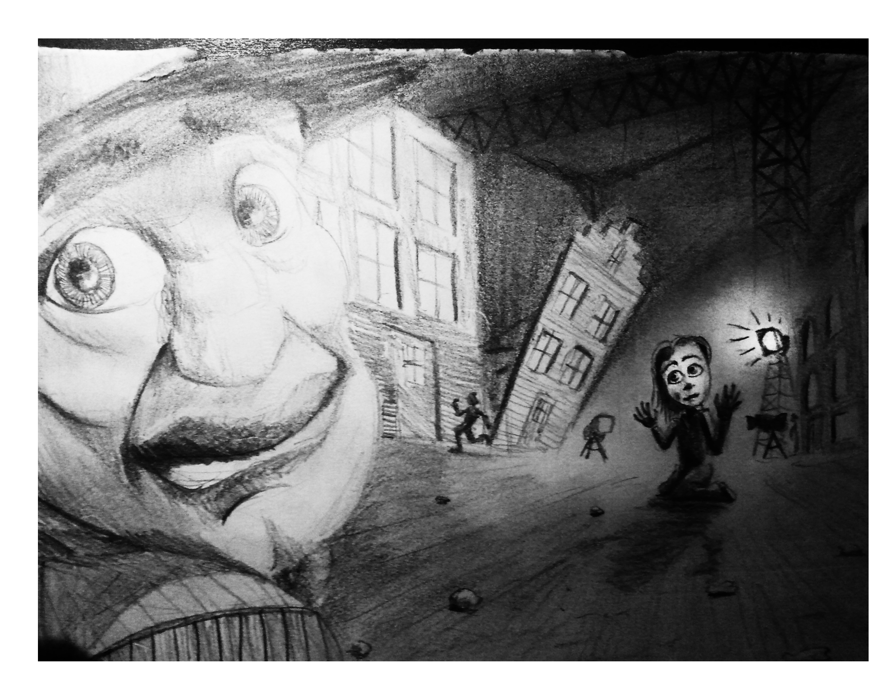
CUT! No, no, no, no!!! We have been over this, several times, What's the matter with you!?