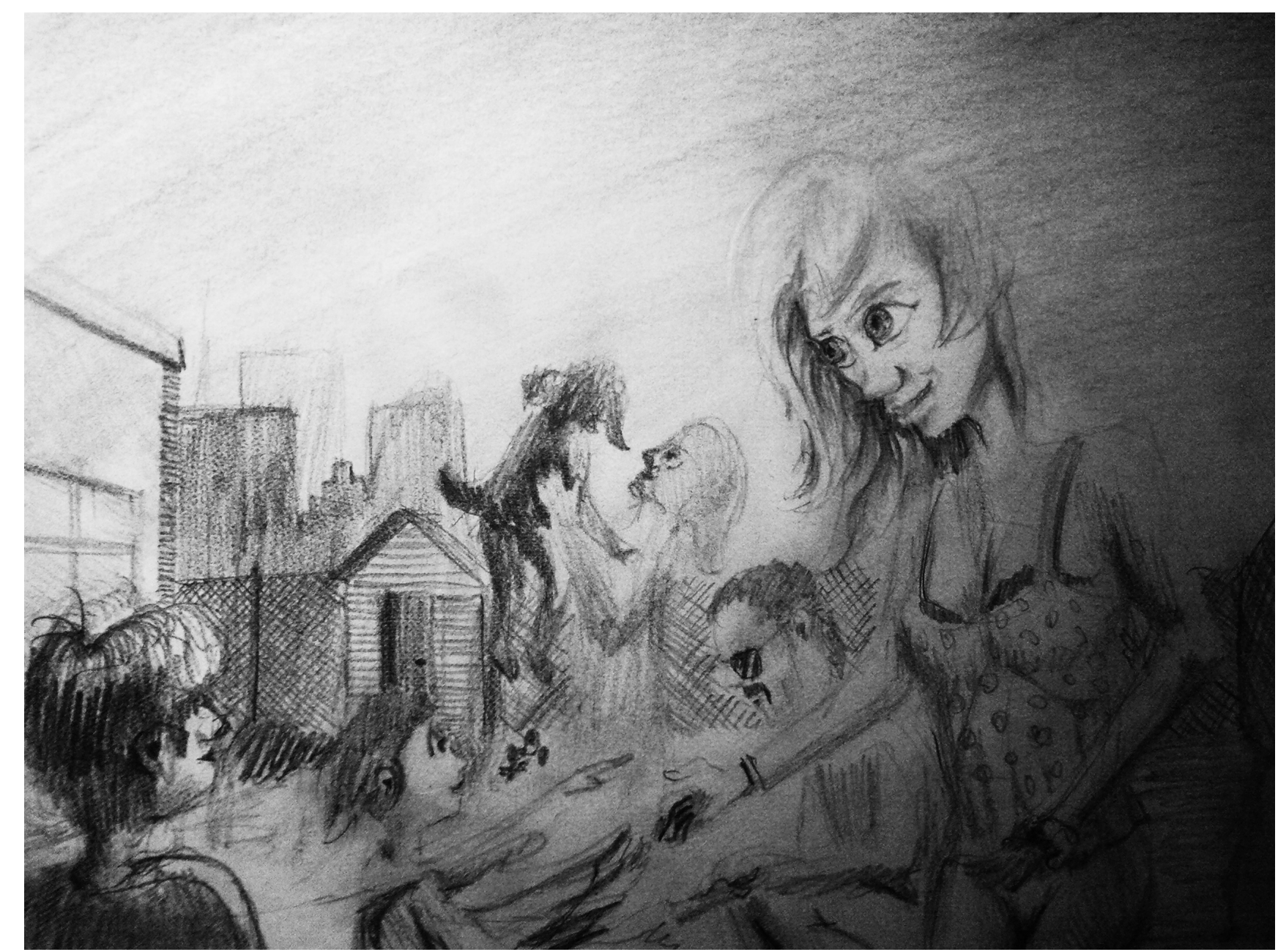
Parents pick their children up. Parents hugging and loving their children