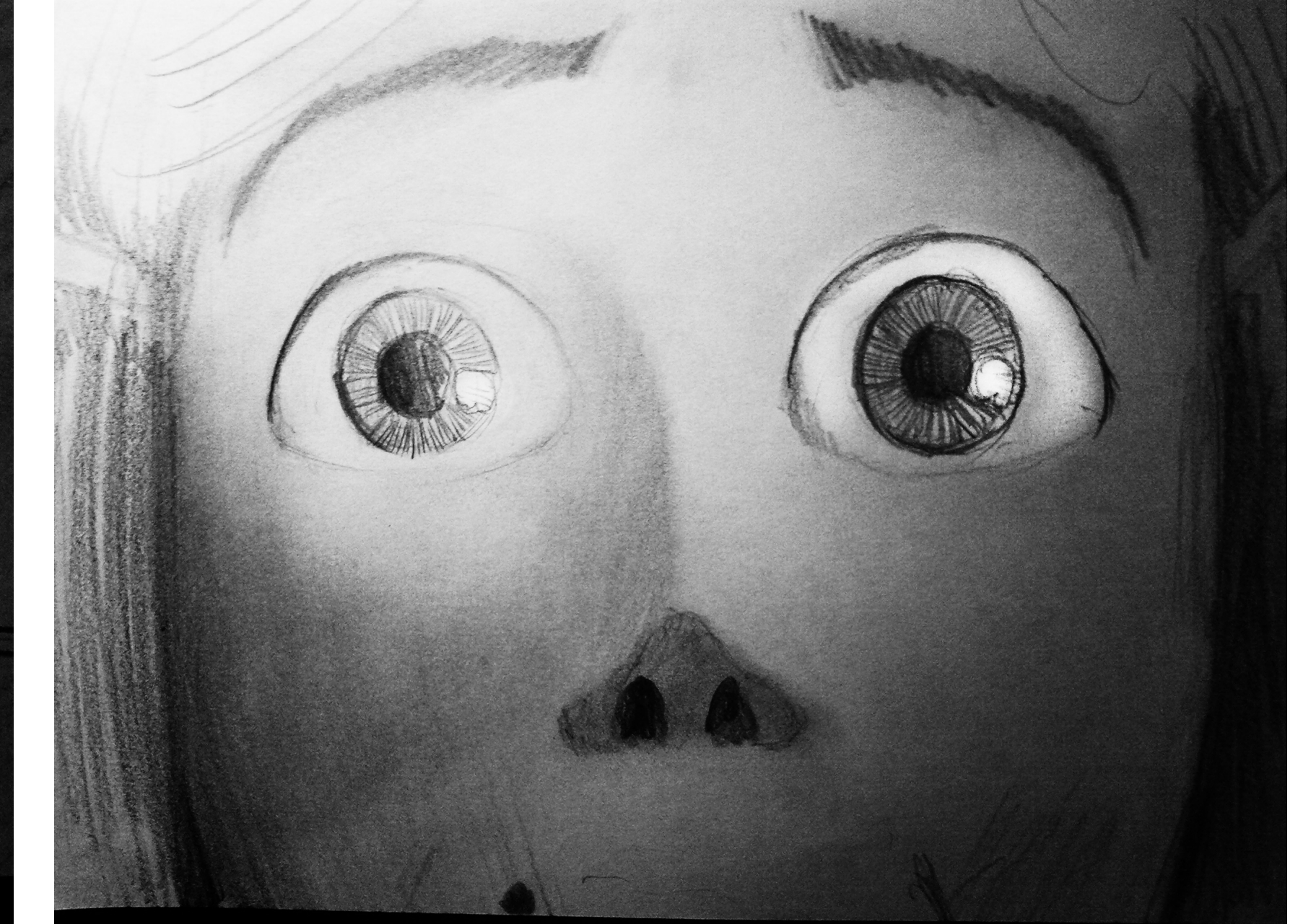
Hopeless Girl fails again ACTION!, The footsteps of the bigman are heared again,, but the girl makes a weird moaning sound and the screen fades to