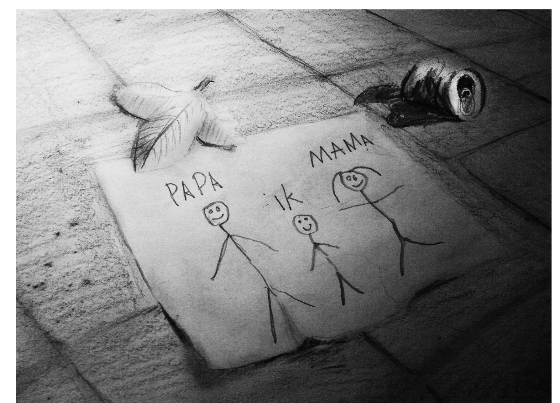
Open ending CONCLUSION Here be credits... and a mysterious little background music for the flavor!