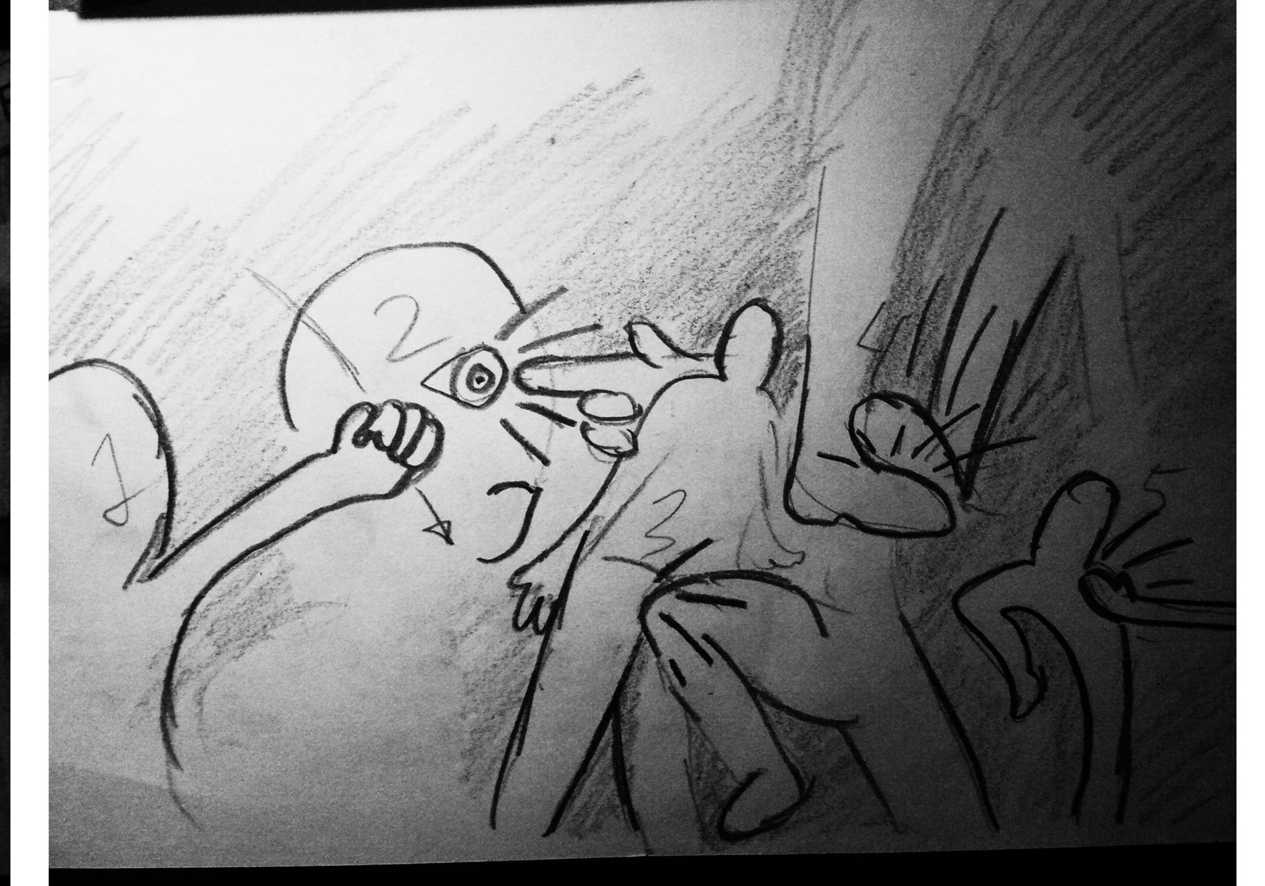
Hopeless Girl gets instructions Oh well, i guess i could show you one last time... as instructed!! BUT HE'S SO SCARY!!! I'am not arguing about this Here be the instructions from the CLOCKHOUSE, simple not to difficult...