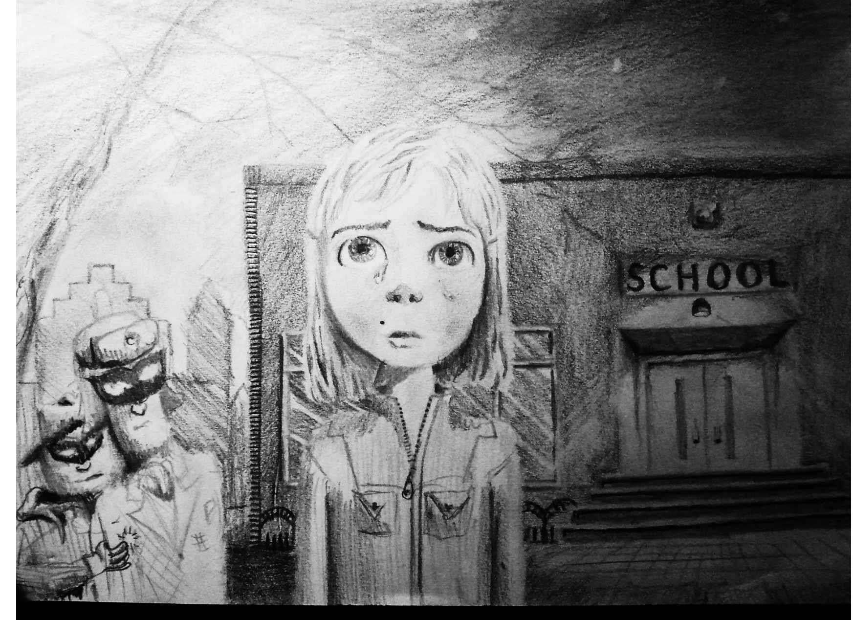
Hopeless Girl decides to walk home PLOT 1 after a few hours the girl decides she cant take it no more and starts walking towards her home, where ever that may be...