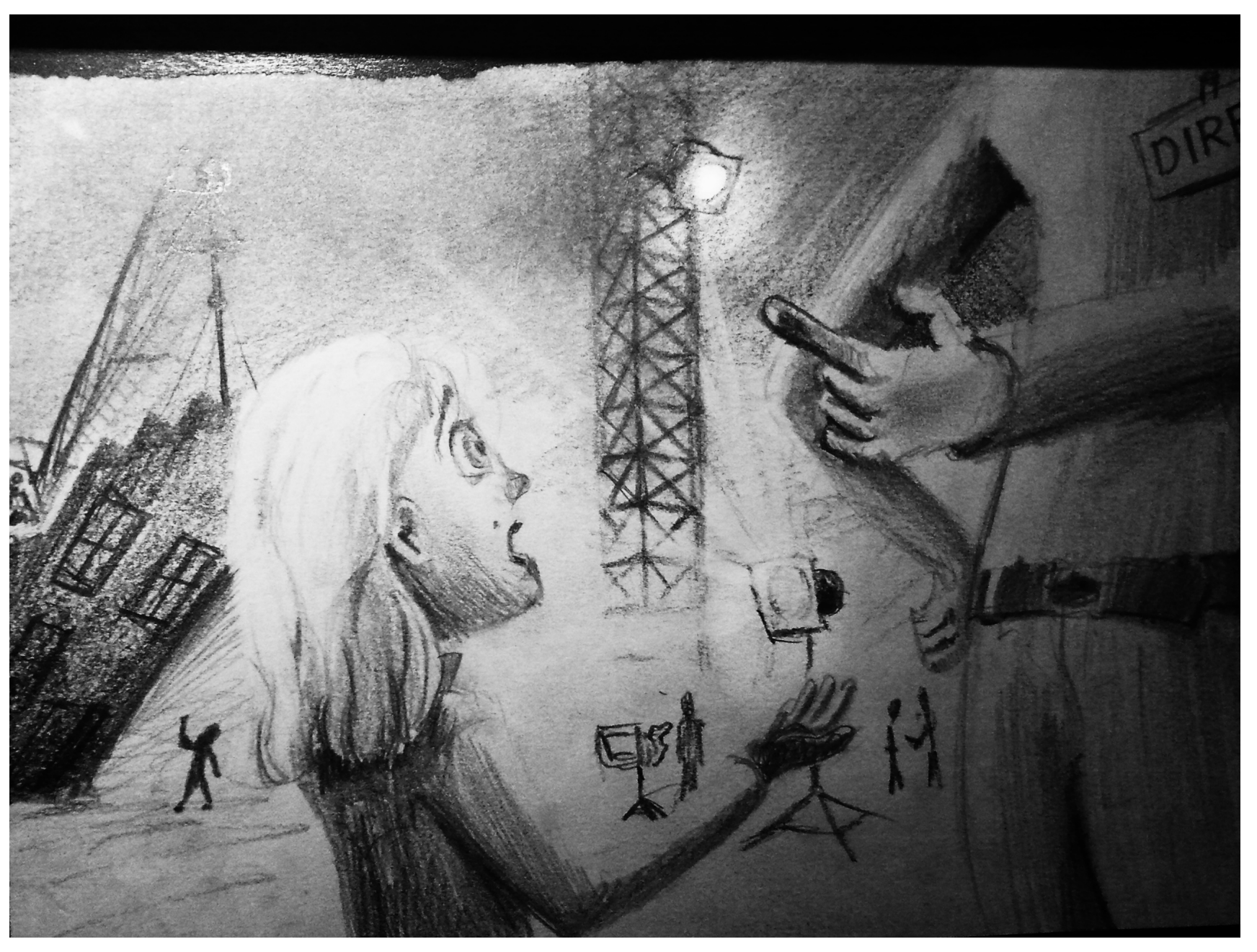
Hopeless Girl argues PLOT 2 Wait... There is a plot within the plot?? You have to fight back, now go or you're FIRED!!! AND DON'T TELL ME I HAVE TO SHOW